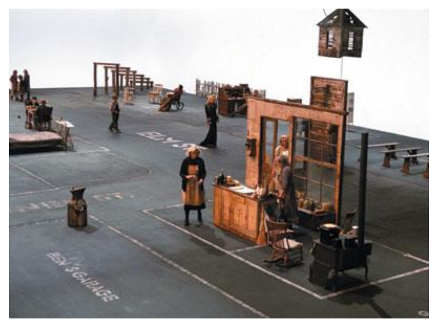
Figure 2: The set of Dogville (2003)

In Germany, a civil rights and privacy campaign group awarded an electricity supplier, which had planned to install smart meters, with the infamous 'Big Brother' prize.<sup>21</sup> In California (U.S), in the city of Ojai, the local council approved a total ban on smart meters because, amongst other reasons, they were " subjecting residents of Ojai to privacy (...) risks ".<sup>22</sup> Other communities in California and the U.S have taken resolutions in the same direction and have shown their intolerance vis-a-vis smart meters.<sup>23</sup>